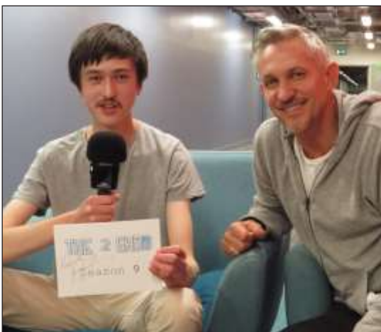
STAR TURN: Gary Lineker meets our Tone

The 2 Show team have been very busy over the summer holidays travelling from Pinewood Studios in London to the BBC's Match of the Day studio in Manchester.