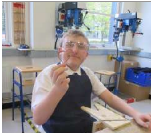
A SHAPE! The design comes to life

This was an excellent opportunity to demonstrate their adaptability and thinking skills as well as their hand eye co-ordination.