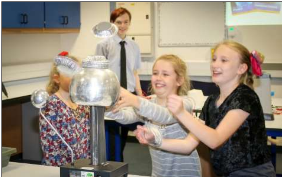
INVOLVED: pupil ambassadors showed parents and prospective pupils a mind-boggling array of activities