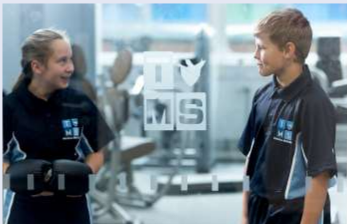
READY FOR ANYTHING: Year 7s have started the year with a hard-working and enthusiastic attitude.

Of course, this doesn't happen by accident and we work hard to make sure the transition from primary school to secondary school is a smooth one and that children understand our expectations from day one. The recent Year 7 parent survey,