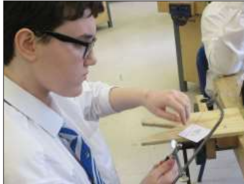
SKILLED: Having created a template, it was now time to cut it out